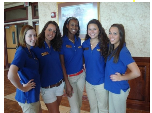
Five of our officers during the Summer Training days.

provide you with information that can be used within your chapter. The event is going to be a lot of fun, a good experience and we hope you look forward to it as much as we do! - Ellen Truckley, Vice