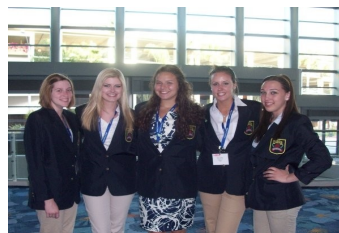
State Officers at ICDC in Anaheim, CA.

nity service activities for the state association of which will benefit a couple well known charities.